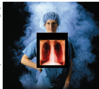
Surgical Smoke Evacuation