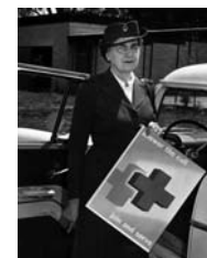
Before OR Nursing Journals